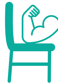
BODY PART MUSICAL CHAIRS

The winning team is the one that manages to get three in a row. This is a fast-paced game, and you'll need to oversee it carefully to keep everyone safe and avoid cheating!